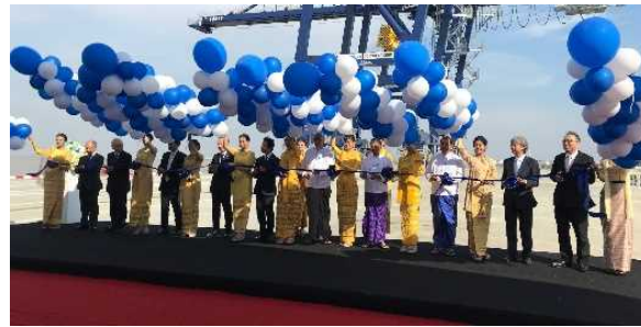
Completion Ceremony (Deputy Minister of Transport and Communications, Myanmar, etc.)