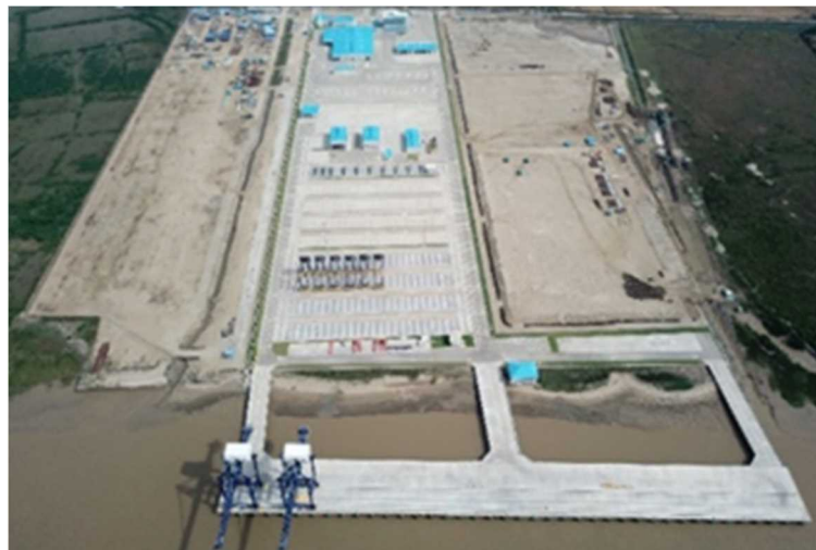
Overview of Completion