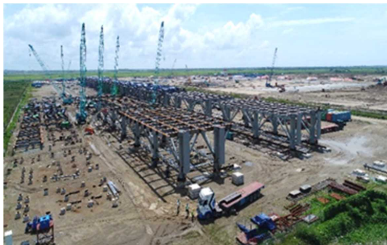
Final Assembly in Temporary Yard